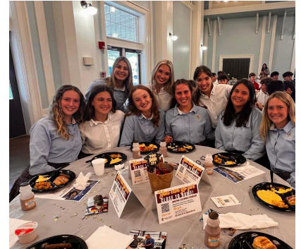
Some seniors at the breakfast