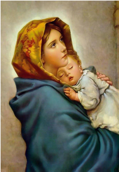
Mary and Jesus