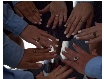
Junior rings last year

Bay St. Louis —Our Lady Academy has many traditions. One tradition, in particular, has a beautiful meaning: the Junior ring ceremony. The Junior ring ceremony, a significant tradition at Our Lady Academy, is a moment when the outgoing Seniors pass on their legacy to the Juniors. This symbolic act allows the Juniors to begin crafting their own legacy for OLA, demonstrating their potential to excel. As they leave their mark on OLA, they can reflect on their ring, a tangible reminder of their time here. This ritual underscores the value of their OLA experience and their lifelong connection to the OLA Crescent. Knowing more about this tradition gives us a chance to prepare for our ring ceremony. This shows us how valuable our time at OLA is and how many memories we get to make before we leave. If your time at OLA is coming to a close, remember all the good times you've had.