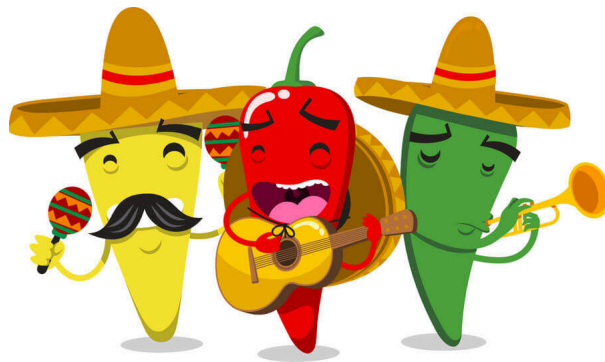
Cartoon depiction of peppers celebrating Cinco de Mayo.