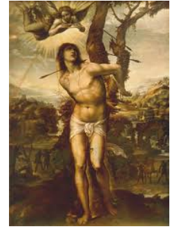
Image of Saint Sebastian being shot with arrows